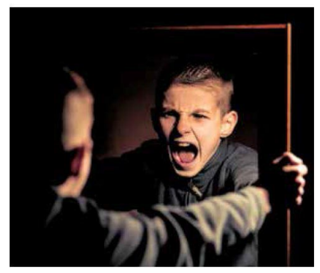
Figure 9.2 Aggression is a feeling of anger that results in hostile and violent behaviour.

The types of aggression are given below: Hostile Aggression Instrumental Aggression Assertive Behaviour