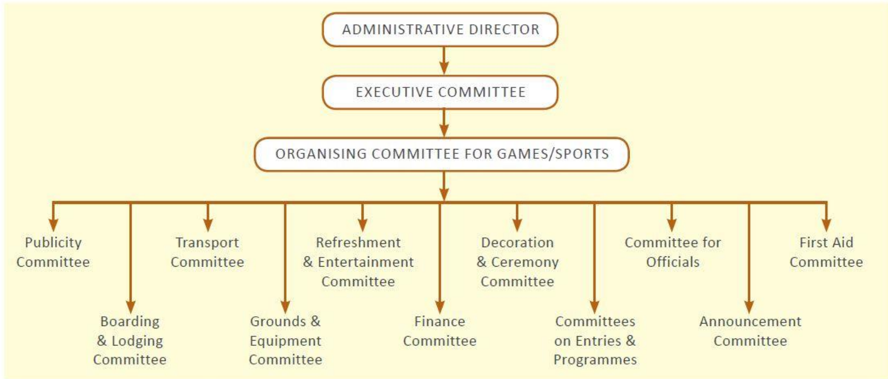
Figure 1.2 Different committees for organising track and field meet/sports