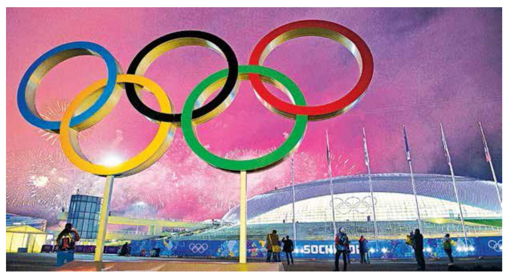
Figure 2.3 The opening ceremony of Olympic Games