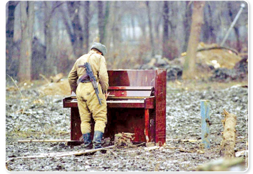
A RUSSIAN SOLDIER PLAYING AN ABANDONED PIANO IN CHECHNYA IN 1994

E. Look at this picture. What does it tell you about war, peace and people? Discuss with your partner.