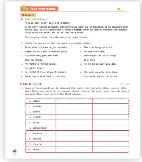
BK 7, p. 48

BK 8 30 (Get Set!), 57 (Get Set! A & B), 67 - 68 Everybody is Doing It (Art and Culture), 140 (J), 155 (F)