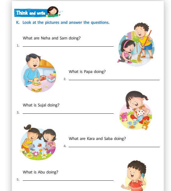
BK 2, p. 40

BK 5 14 (N), 47–51 (In Rhino Land) SST, 59 (Get Started) Art and Culture 81 (D), 117 (Q), 121 (Get Started)